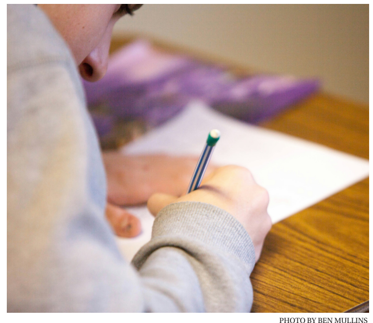
stakes test, meaning colleges The 2024 PSAT 8/9 scores were TESTING DAY - Freshman take the first of three PSATs required of Walls students

"It's just extra practice and it no downside to taking it," Frost