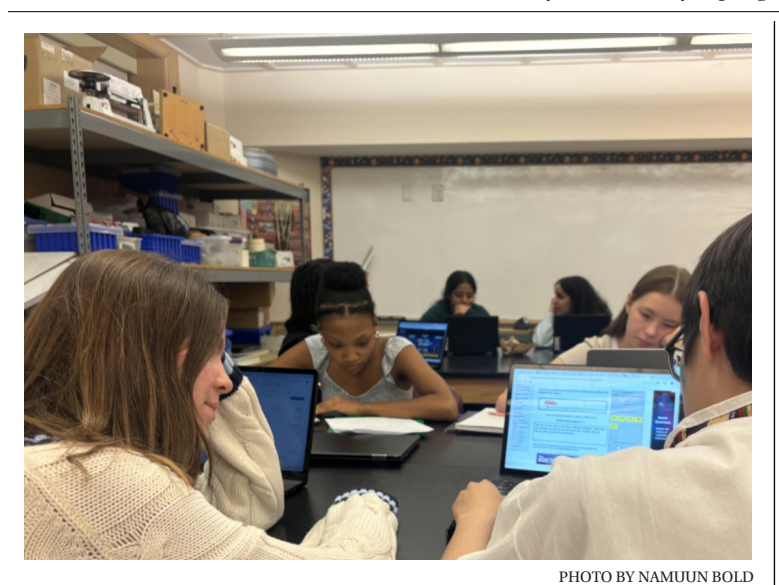
STRUGGLING WITH STEM - Limited space in upper-level STEM leaves little for Walls women.