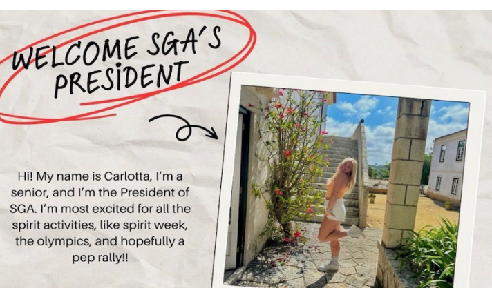
VIA @SWW SGA ON INSTAGRAM FINALLY DECIDED - SGA premieres new members

When it was finally time for the election, technical difficulties led the link to be sent out three separate times.